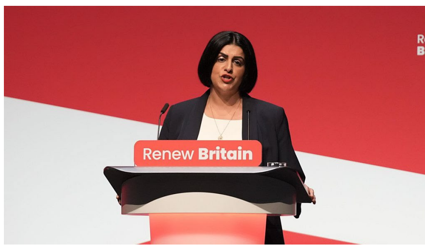
Home secretary, Shabana Mahmood outlines plans to introduce “Earned Settlement”

The biggest development affecting international recruitment in adult social care is the Government’s announcement last week regarding plans to introduce the “ Earned Settlement ” Model — hailed the most significant overhaul of the UK migration system in 50 years. The plans build on earlier measures, including the closure of the Health and Care Worker Visa route in May 2025, signalling a continued tightening of long-term settlement opportunities for overseas care staff.