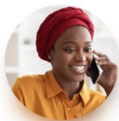
DISPLACED CARERS IN THE SOUTH EAST

Find out how SESCO can help you recruit experienced overseas care workers, already in the UK, who have become displaced due to their previous sponsor having had its license revoked.